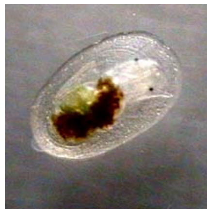
Figure 2. Young translucent Ferrissia fragilis from ornamental aquarium