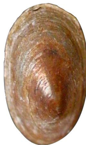
Figure 1. Ferrissia fragilis (Tryon 1863)

One ecological aspect of this expansion is very interesting. Water temperature is very often an important factor limiting the expansion range of alien species. It is especially usually for species which have spread as a result of the of aquarium trade. These species in Europe (except more southern regions such as Mediterranean, Balkans, Southern Ukraine, Crimea and Caucasus) inhabit mostly artificial warm-water habitats (reservoirs-coolers, reservoirs of botanical gardens etc). Despite this, F. fragilis survived outside its native range during the abnormal cold winter 2005-2006 when the air